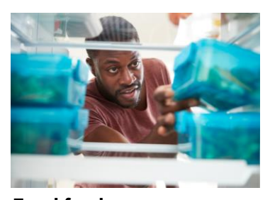
Food freshness detection

Reduced power consumption - optimal for battery operated devices